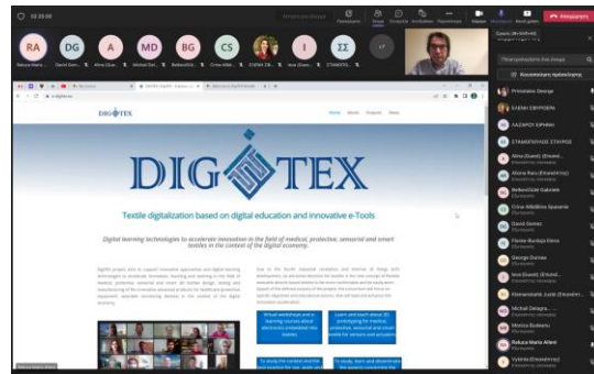
Figure 4 Presentation of the project webpage