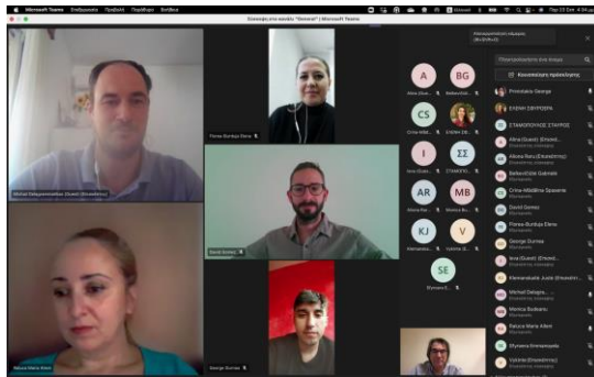
Figure 1 Webinar on 23/9/22