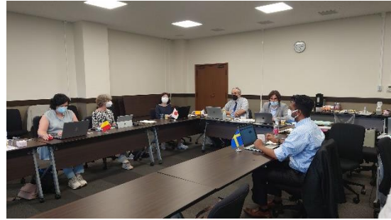
Figure 1(a,b) Meeting at Shinshu University

Added value of the mobility (in the context of the modernisation and internationalisation strategies of the institutions involved):